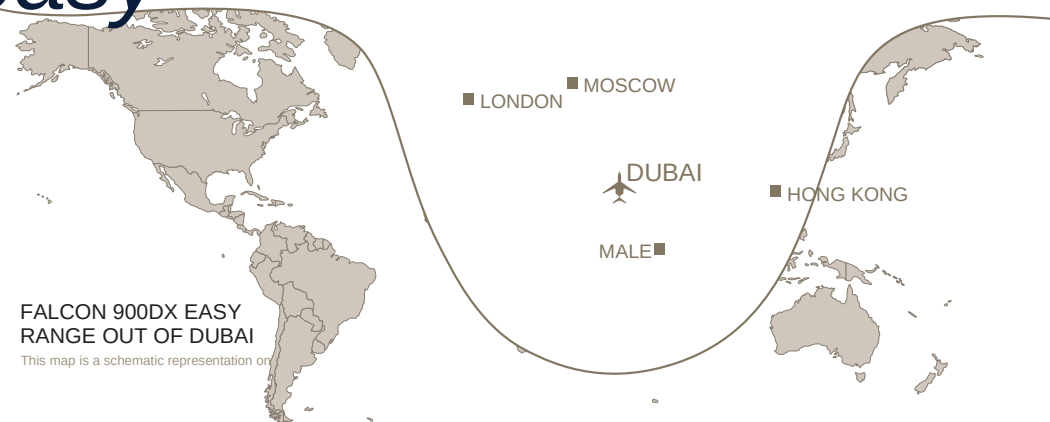
FALCON 900DX EASY RANGE OUT OF DUBAI This map is a schematic representation of the range.