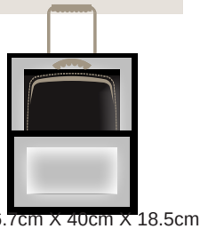
56.7cm X 40cm X 18.5cm