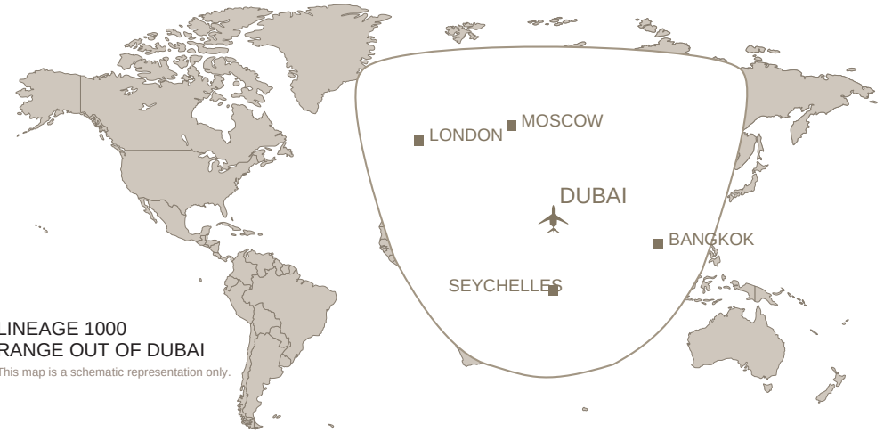
LINEAGE 1000 RANGE OUT OF DUBAI This map is a schematic representation only.