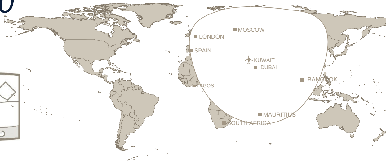
LEGACY 600 RANGE OUT OF KUWAIT

This map is a schematic representation only.